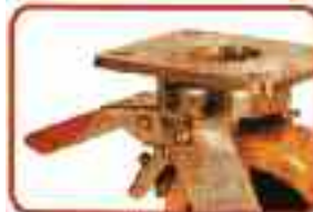
TL/LE (Power Towing)